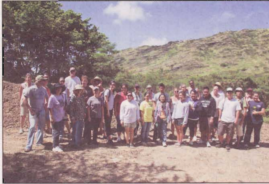
Volunteers gathered in front of the limu piles at the Aloha 'Aina O' Kamilo Nui restoration project in Kamilo Nui Valley.

Through Matson's Ka Ipu 'Aina project, the group was given a Matson container for the Saturday clean up. Included in Matson's donation is hauling away the segregated litter/trash collected. Metals will go to Schnitzer Steel, tires to Unitek, green waste to Hawaiian Earth Products, burnable trash to H-power, and everything else will need to go to Waimanalo Gulch Landfill.